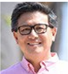
John Chiang Former California State Treasurer & Controller Co-Chair, California Forward 2012-21